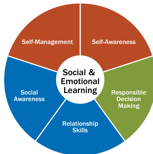
Figure 1. The Five Social and Emotional Learning Core Competencies